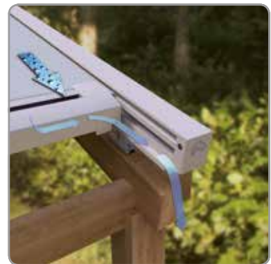
Mechanical safety for the bottom rail