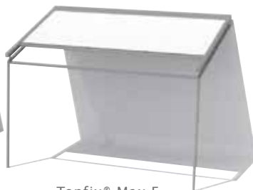
Topfix® Max F