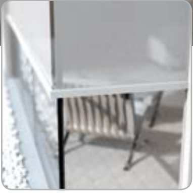
PATENTED TECHNOLOGY & PATENT PENDING